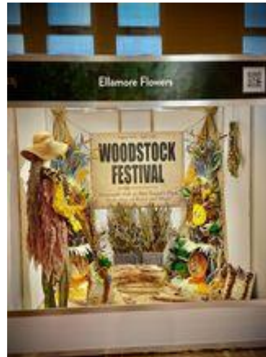
Ellamore Flowers outstanding window display at the Melbourne and International Flower Show.