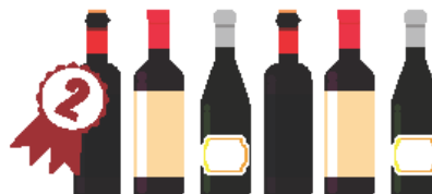
6 bottles mixed Australian wine

Raffle drawn on 21st of June 2023* unless 100 tickets are not sold