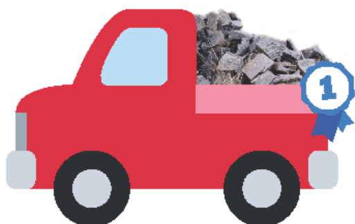
aged gum, approx 1 ton, spllt wood