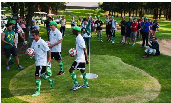
Australian football icon Tim Cahill leads his teammates off of the green after a birdie.

Not familiar with the sport? Check it out on youtube under 'Foot Golf Promotional Film'.