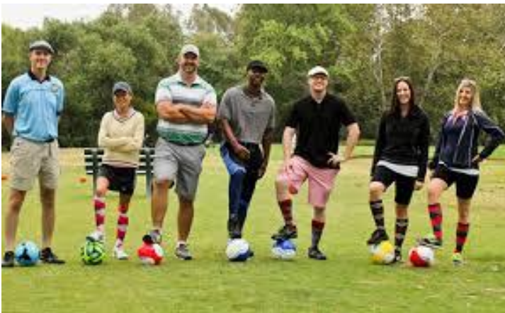
For old and young, male and female.

There was a demonstration day on Sunday 14 th of February and the official opening will be in March.