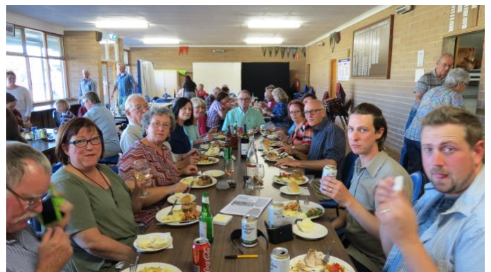
Many Thanks to Torrens Valley FC who hosted the Community Dinner on 28 th February! Great work!