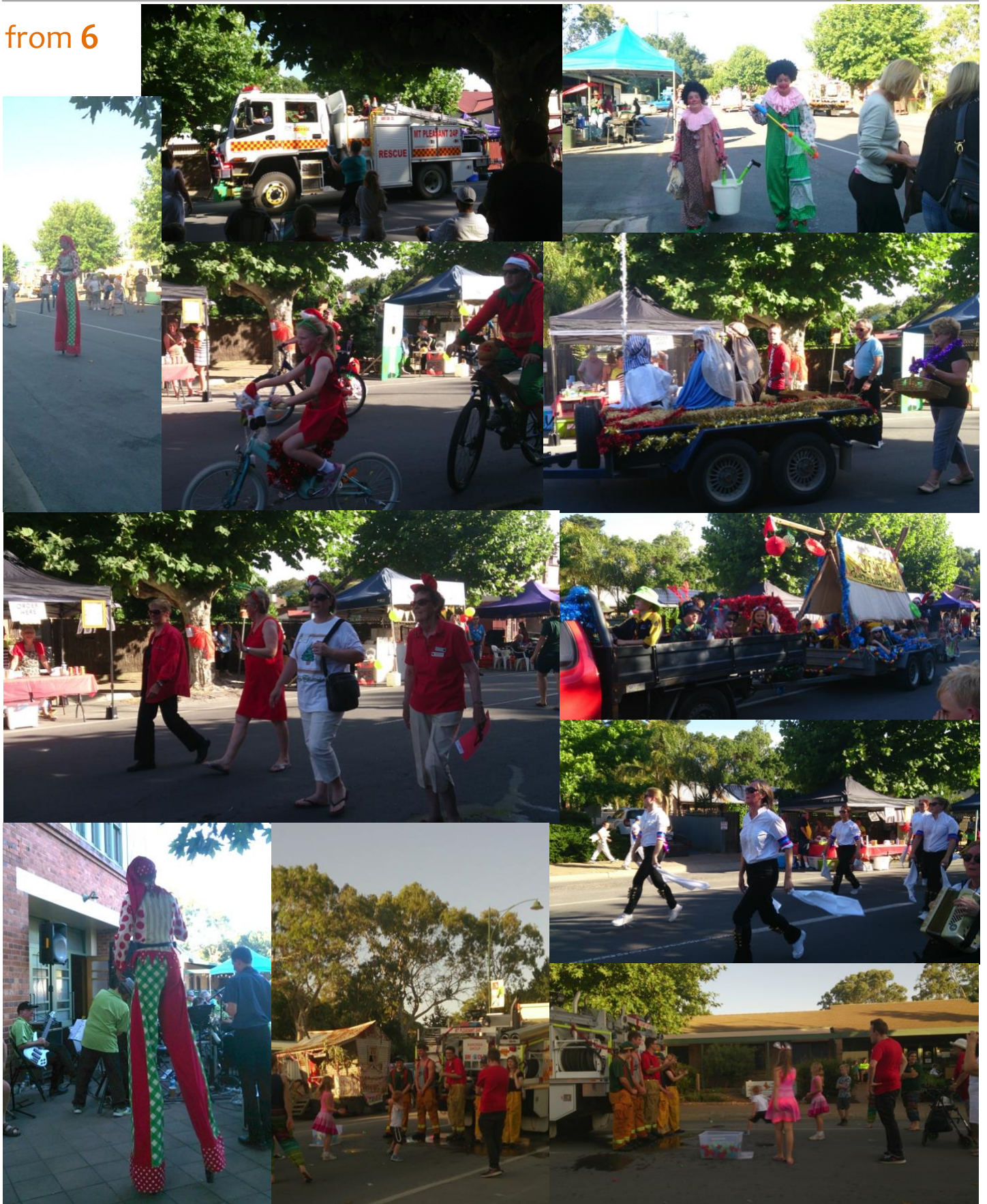
Once again – despite the very warm weather – the Mt Pleasant Street Party was a huge success. Held in conjunction with the Maker’s Market, there was never a better opportunity to buy local and support our community. This year we were treated to the Amazing Drumming Monkeys, The Chicago Show Band, Morris Dancers, a Magician, a stilt walker, Clowns, Face painting, Bouncy Castle, Food, Craft Stalls, & more.