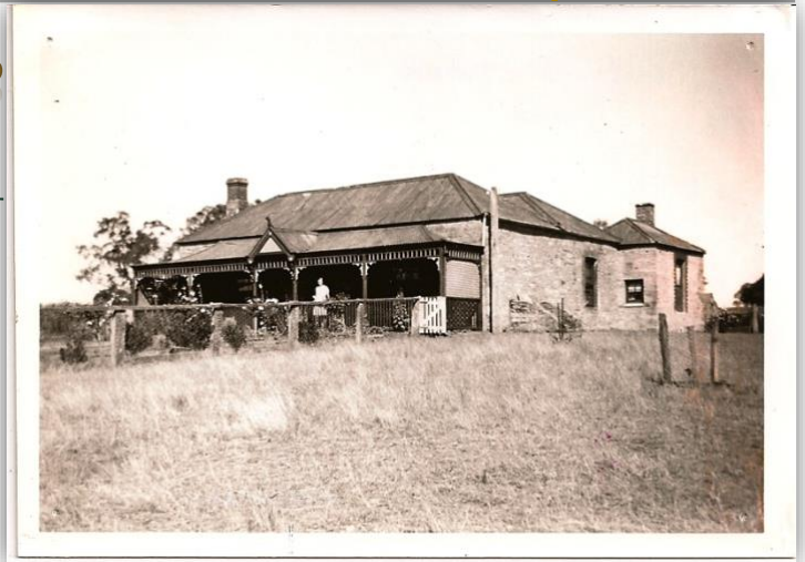
'Updown Park' - the Deane family farm.

the Exchange who would spread the word of a bushfire. Farmers in the district had their own fire units, which were used at various incidents.