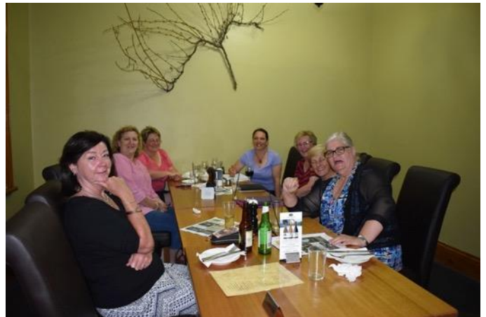
Mount Pleasant won the SACWA Hills and Murraylands Floriculture Group award. (below)