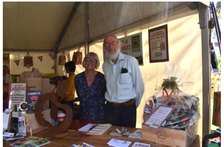
Even though the market was officially closed for Show Day – stallholders were still to be found in the Gourmet Market Tent.