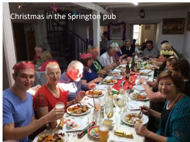
Christmas in the Springton pub