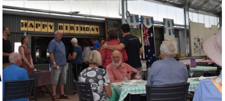
Some pics from the celebrations

Our Hot Weather Policy Mount Pleasant Farmers Market will be open as usual on days of forecast extreme high temperatures however, will close early than scheduled time if & when the current temperature exceeds 38 degrees in Mount Pleasant as reported by Weatherzone. Shoppers are encouraged to shop early on these days due to the possibility of the markets early closure.