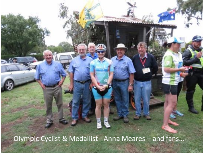
Olympic Cyclist & Medallist - Anna Meares – and fans...