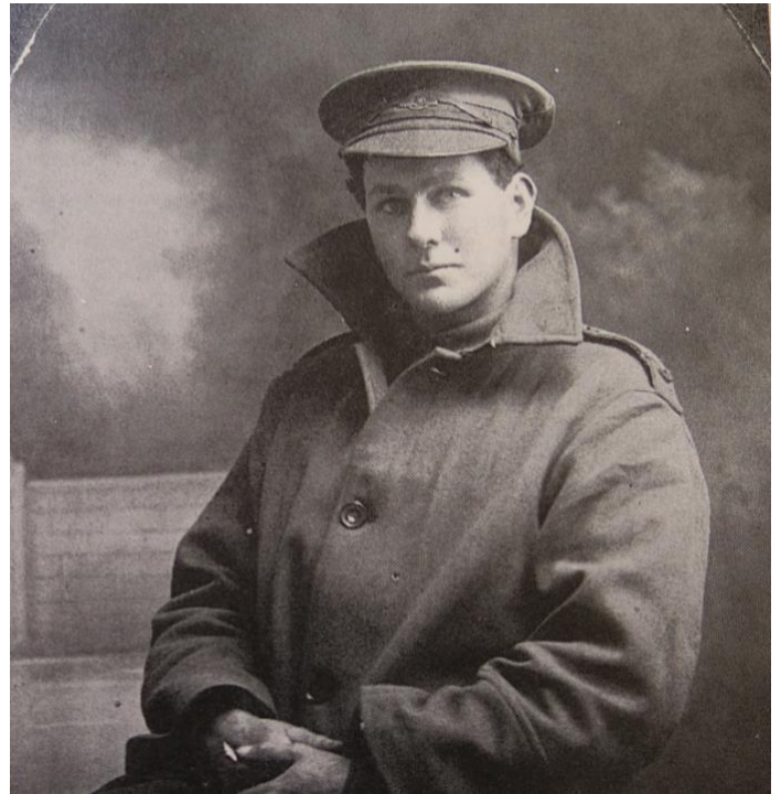
The Advertiser (Adelaide, SA : 1889 - 1931) Thursday 24 August 1916 p 8 Article