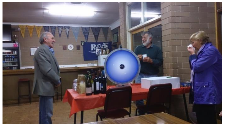
The August Community Dinner was a little down in numbers – probably because there was so much else on,