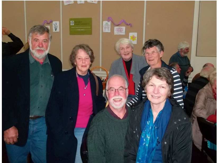
Most of the winning Mount Pleasant team members who cleaned up at the Fund Raising Trivia night, in aid of the Springton Hall. A great night out – lots of fun and great prizes! Look for it next year around May/June. Good to think we can help our near neighbours.