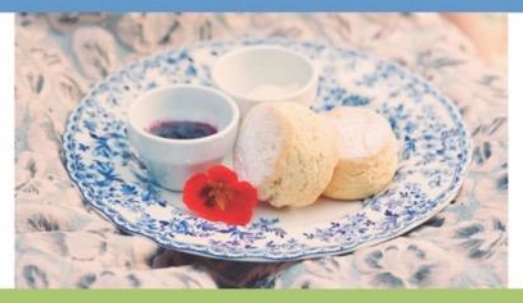
Devonshire Tea will be served each Thursday morning. A salute to 'Ye Olde Maye Fayre' will be held on the 14th of May with stalls, and a light luncheon.