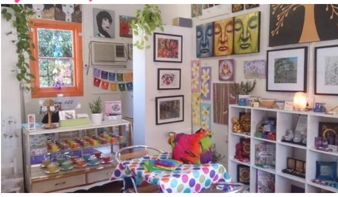
Gallery 102 is a great place to find that special something for the mum who has almost everything!