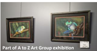
Part of A to Z Art Group exhibition

All welcome! If you wish to book a table to enjoy small plates or regional platters, bookings and more information will be available via the Barossa Chateau website. Meanwhile, keep up to date with the A to Z Art Group by following their facebook page.