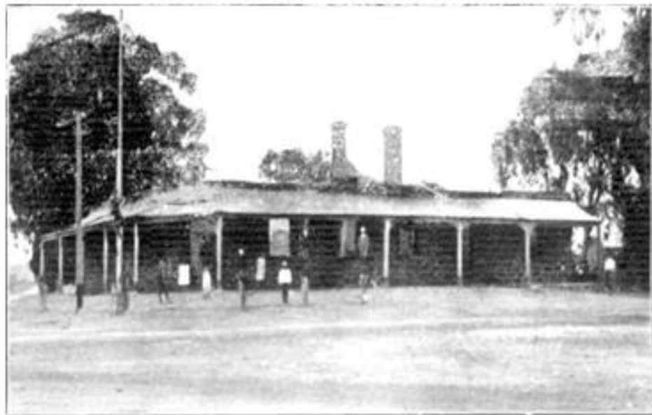
Travellers Rest Hotel showing badly damaged roof after 1914 fire