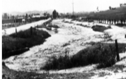
1923 Flood (Lyndoch Valley Road)

On Tuesday morning the manager (Mr L. Harper) was busily engaged, with a number of men, cleaning out the dirty water and mud, but as the floors are concrete, no actual damage was caused. The crusher pit was full of water, and the machinery was submerged. At Lyndoch the flood was at its height at 10 a.m. on Monday and the roads in the town were left in a bad state when the waters subsided. [However] matters were not so bad as in 1913 when many fences and fruit trees were washed away and houses inundated.