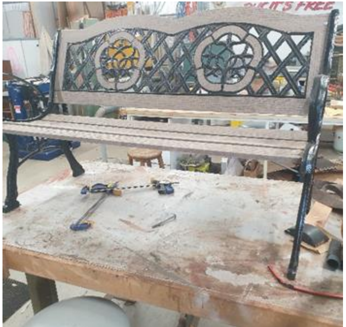
Restoration of a bench at the S.B. Mens Shed