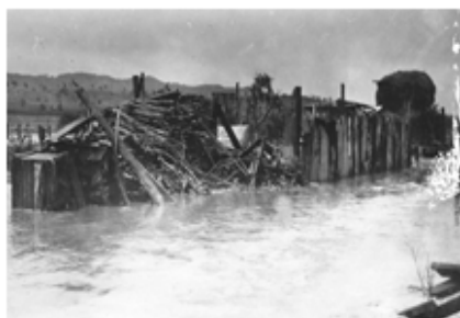
1913 Flood (Tanunda Road Corner)

About 6.00 p.m. on 13th February, Lyndoch recorded four inches of rain in one hour. The rush of water from the hillsides to the low lying ground was terrific and the Lyndoch Creek was soon flooded spreading to a width of four hundred yards. Many of the houses on the eastern side were inundated and the floors covered with silt. Large numbers of fowls and turkeys were washed away while several pigs were also washed down the creek. Damage to the amount of £100 was sustained by Mr Menzel. Mr Wilton was washed off his feet while crossing the road in front of Leahy's Hotel.