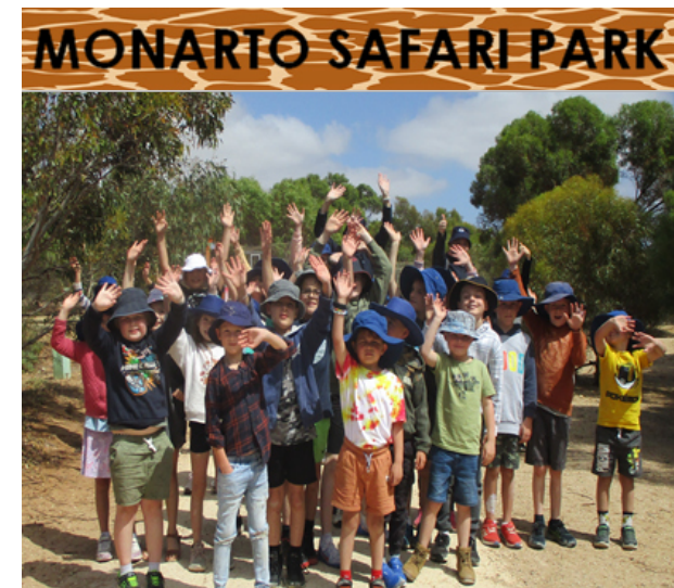
The OSHC children were excited to be out at Monarto over the Christmas break

We had a very successful vacation program with lots of positive feedback from the children. Photo boards are displayed at OSHC & we encourage everyone to come and have a look at the awesome activities that were enjoyed by all. Bounce, Monarto, Roller skating, Adelaide Goal and the Gorge Wildlife Park were the excursions on offer and were a lot of fun. Some of the incursions we had were Tri-skills, Circus Elements and the Marty McBubbles' cool science show. I think the biggest highlight was our Christmas party day and a visit from Santa.